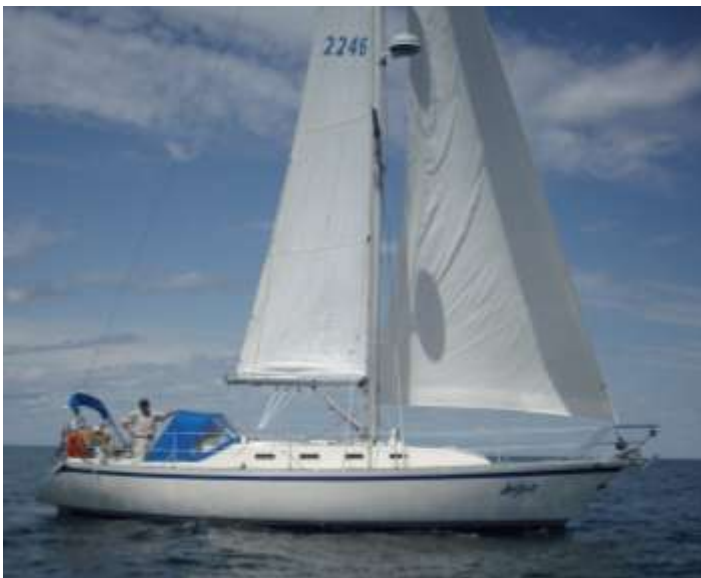
Art's Last Sail at 6 knots aboard Antje II